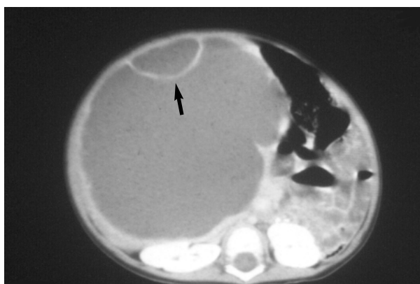
Figure 1. A computed tomography scan demonstrates multiple septated cystic lesions (arrows) in right lobe of the liver of the case patient. The fluid in the large cysts appear to be more dense than clear. The normal liver tissue has been pushed to the edges by the huge internal cystic mass. Both images demonstrate the bowel loops pushed to the left side of the abdomen by the large liver.