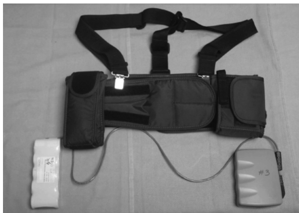
Figure 3. The belt and shoulder strap assembly for the image receiver/recorder unit and battery pack.

antenna array and recording device to the physician. It should be noted that gastrointestinal motility is variable among individuals, and hyper- and hypomotility states affect the free-floating capsule's transit rate through the gut. Download of the data in the recording device to the workstation takes approximately 2.5 to 3 hours. 3 Interpretation of the study takes approximately 1 hour. Individual frames and video clips of normal or pathologic findings can be saved and exported as electronic files for incorporation into procedure reports or patient records. Figure 4 shows some examples of images collected during capsule endoscopy.