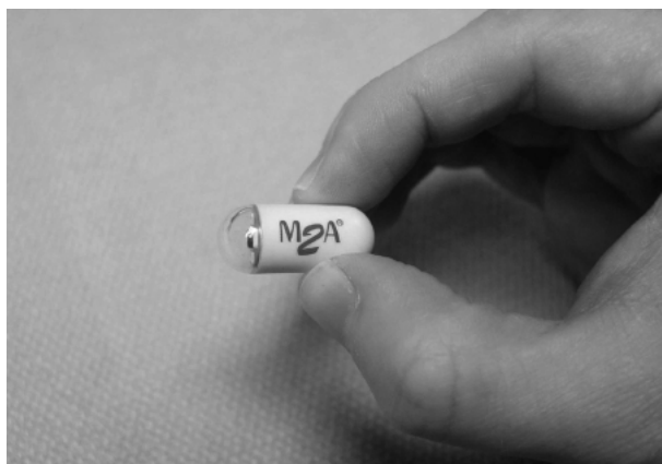
Figure 1. The imaging capsule.

software allows the viewer to watch the video at varying rates of speed, to view it in both forward and reverse directions, and to capture and label individual frames as well as brief video clips. Images showing normal anatomy or pathologic findings can be closely examined in full color. A recent addition to the software package is a feature that allows some degree of localization of the capsule within the abdomen and correlation to the video images. Another new addition to the software package automatically highlights capsule images that correlate with the existence of suspected blood or red areas.